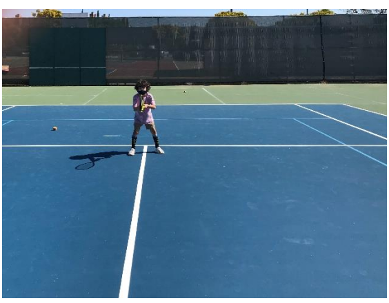
Point Loma Cabrillo after