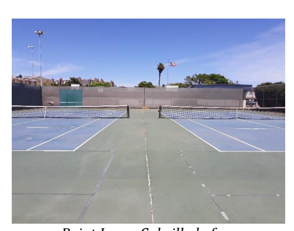
Point Loma Cabrillo before